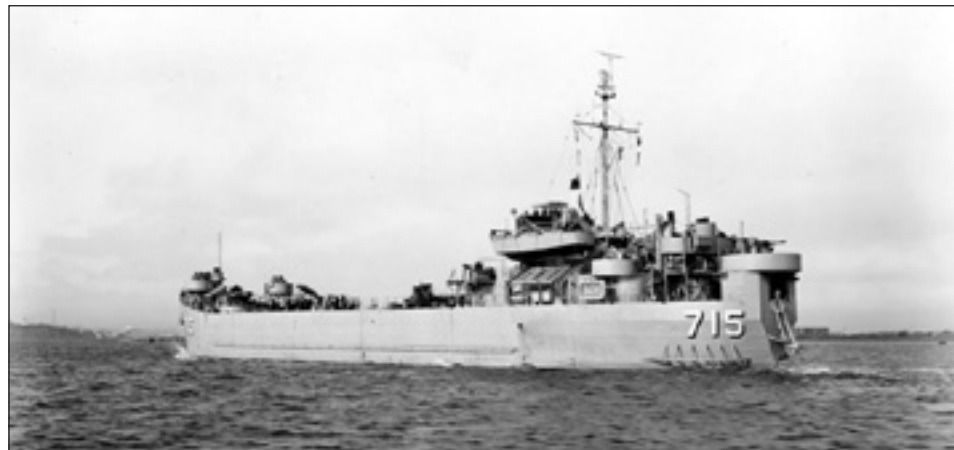
LST 715 served in WWII at Iwo Jima, at Inchon in Korea & Vietnam.

Our paths did not cross again after my tour in Viet Nam until our association began. I saw his name on the roster and